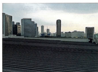
The zinc roof above Club V6 Armani was allowing too much SPL into the surrounding residences